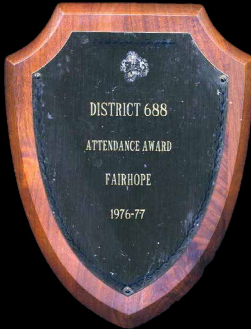
1976–77 Attendance Award