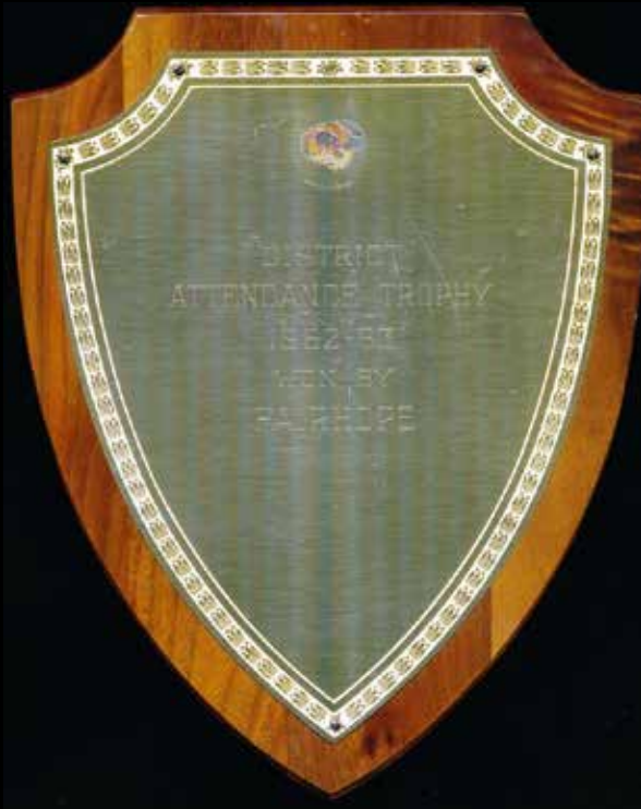
1962-63 Attendance Award