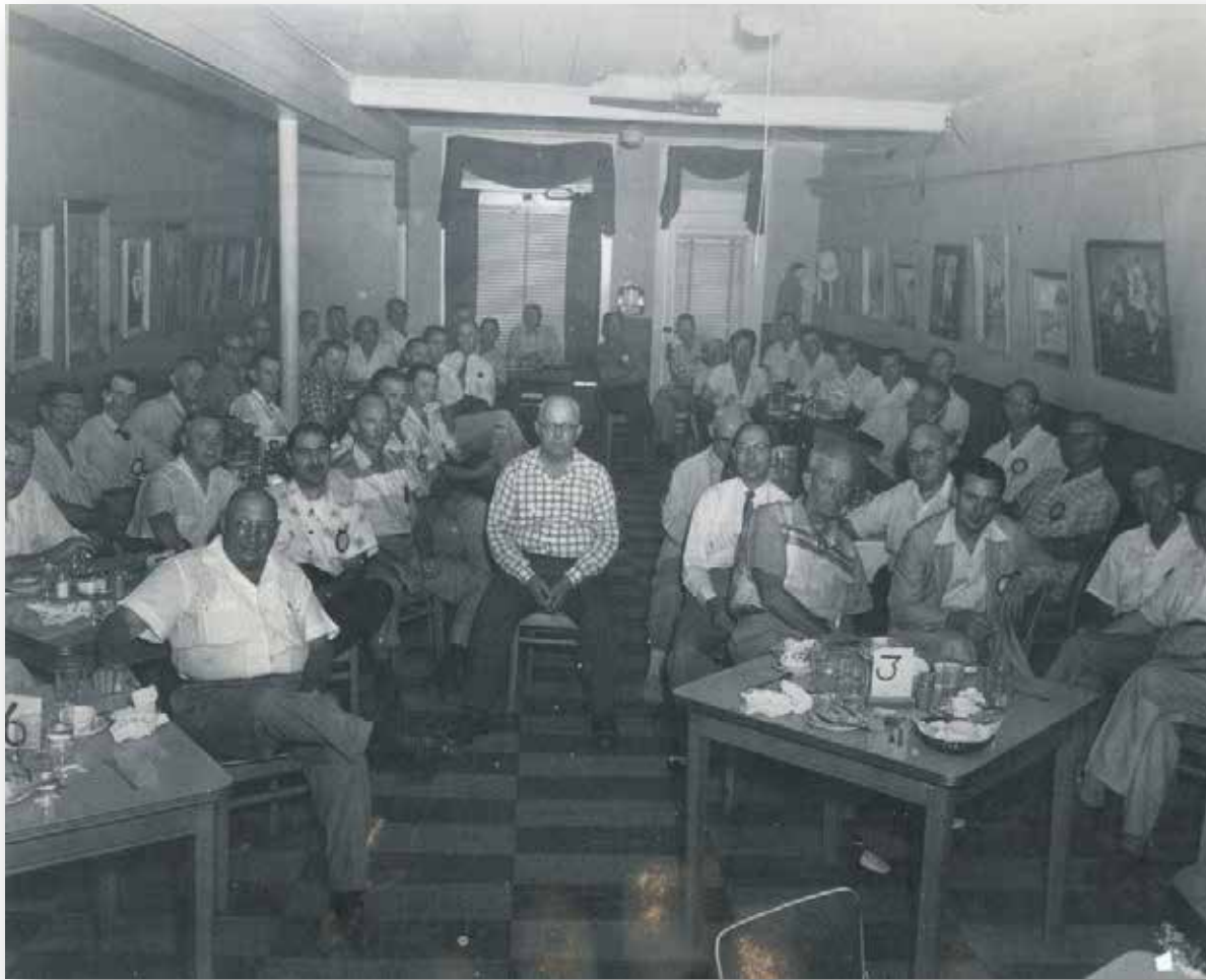
At "Dale's Restaurant" (still a mystery) in 1955