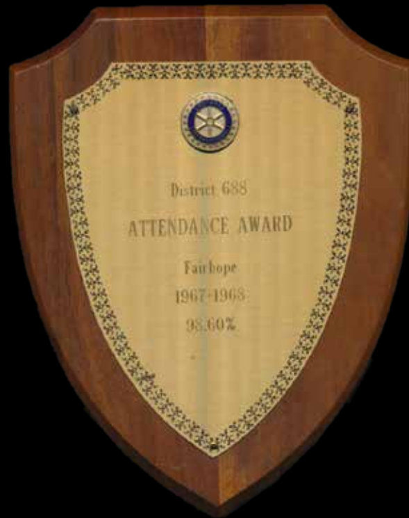
1967-68 Attendance Award 98.60%!