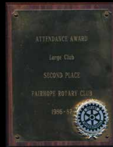
Attendance Awards from the 1980s First or Second Place in Seven Years