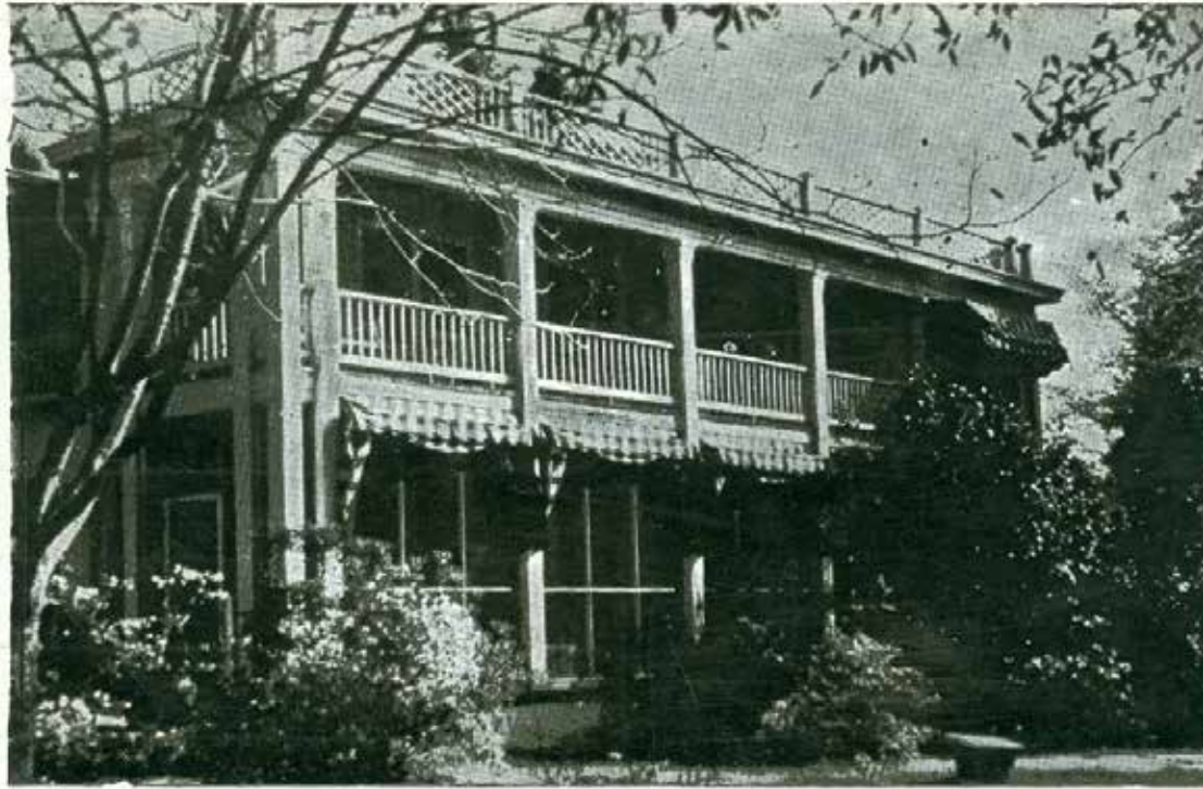
THE COLONIAL INN, on the Bluff Overlooking Mobile Bay, FAIRHOPE, ALABAMA

From 1944 through 1951, we enjoyed the hospitality of the classic Colonial Inn on Mobile Street