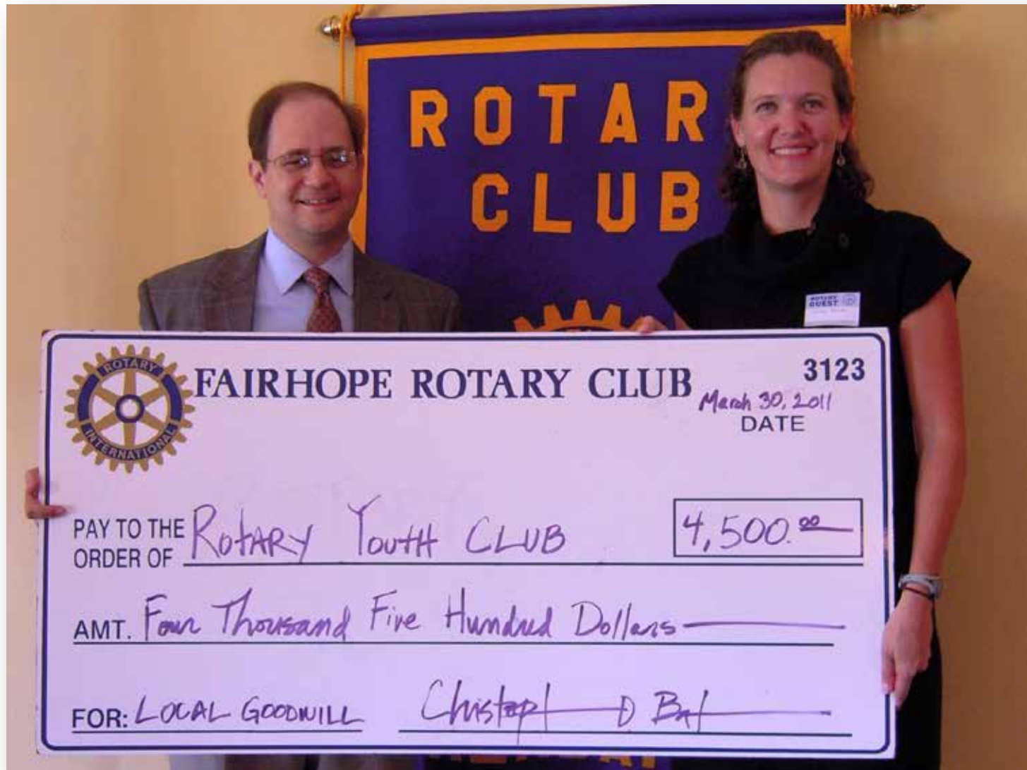
The 2011 check (a little more each year)