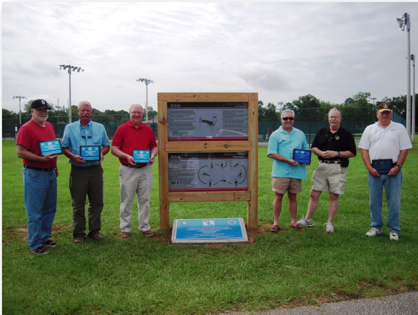
Dedication of the Fitness Trail at Stimpson Field