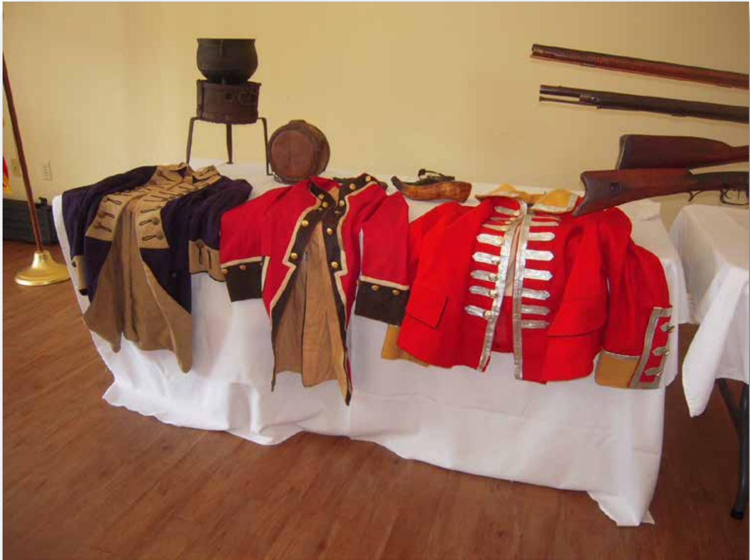
Revolutionary War uniforms and gear