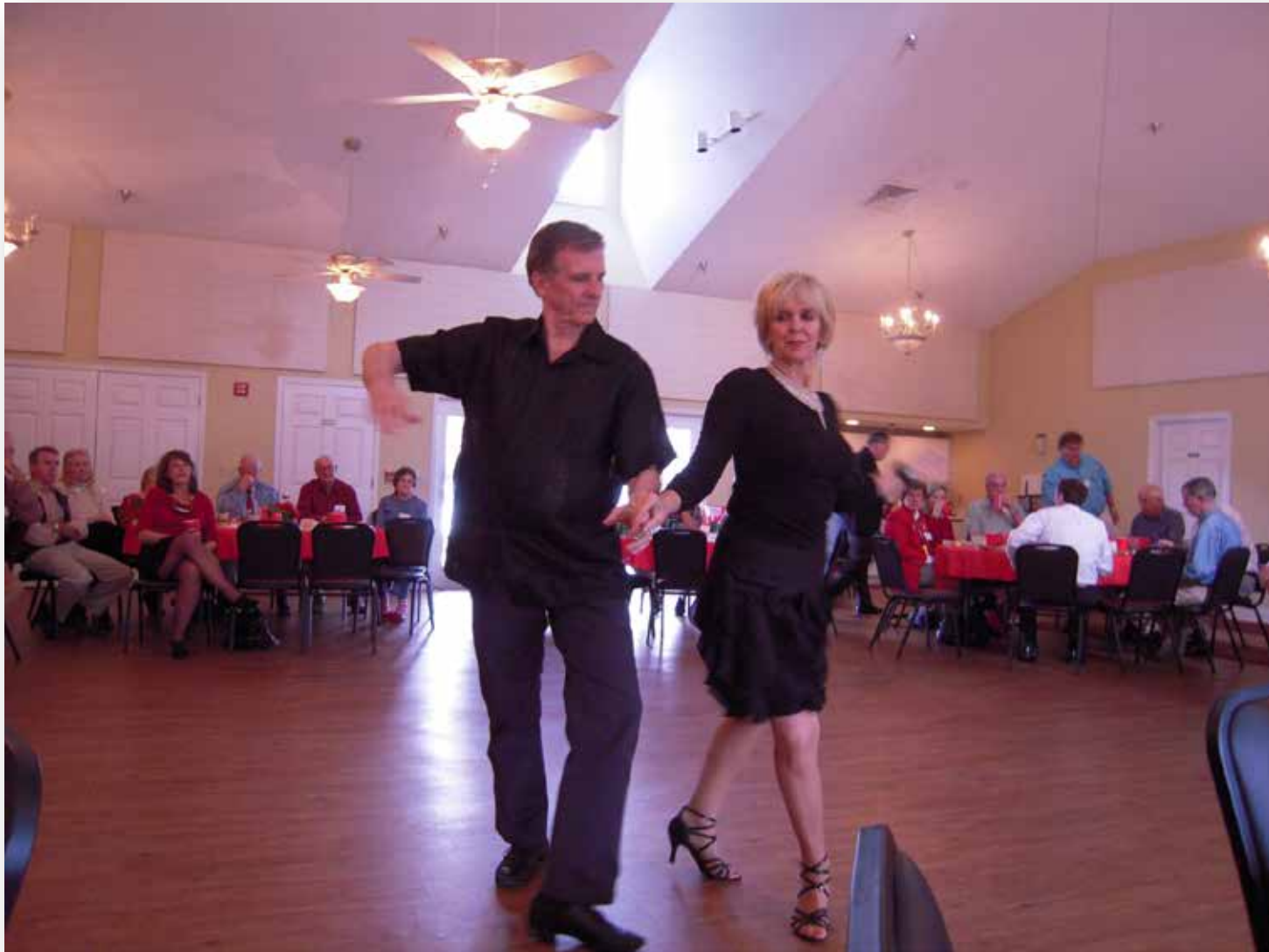
A demonstration of ballroom dancing