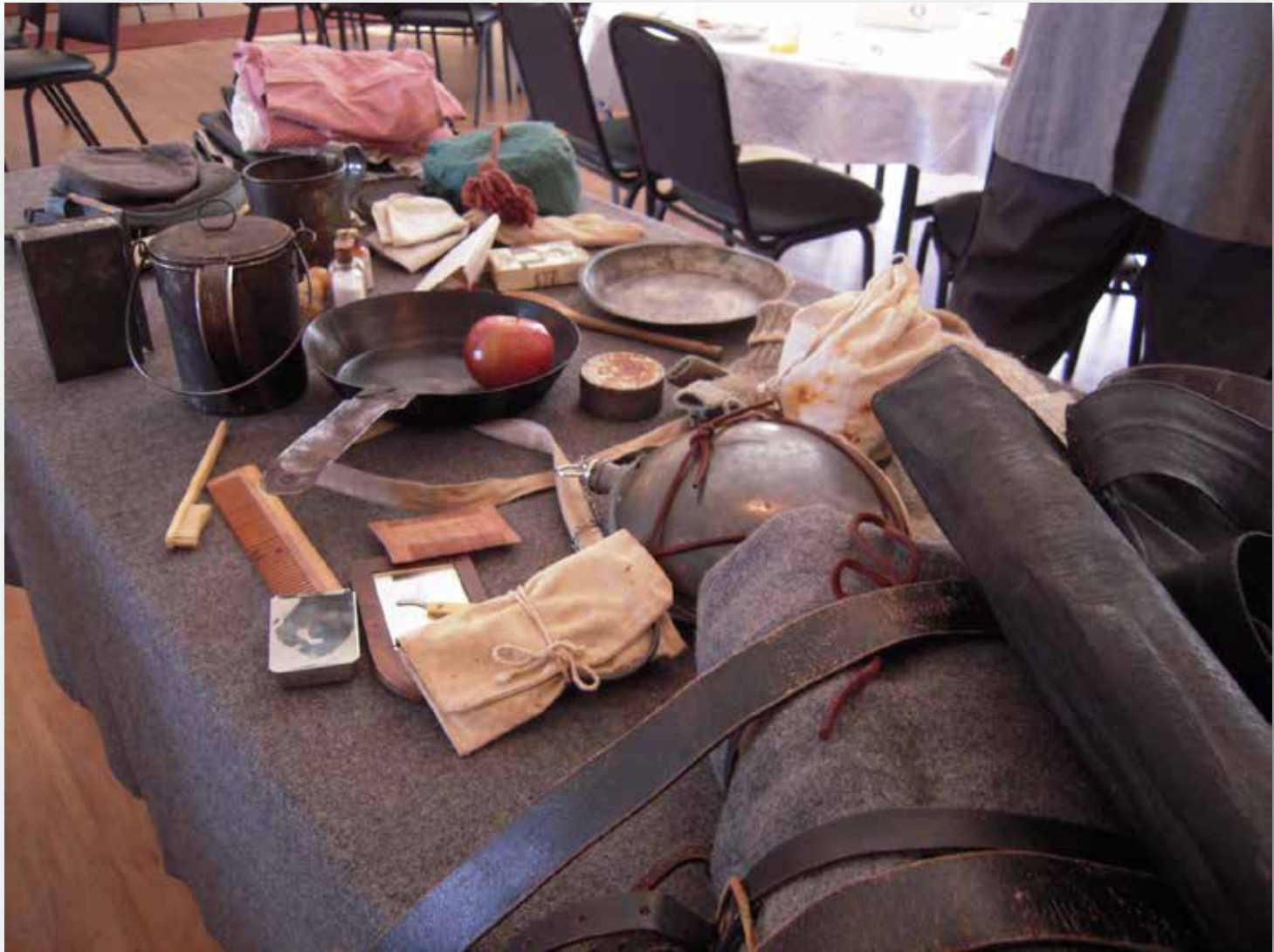
More Civil War gear