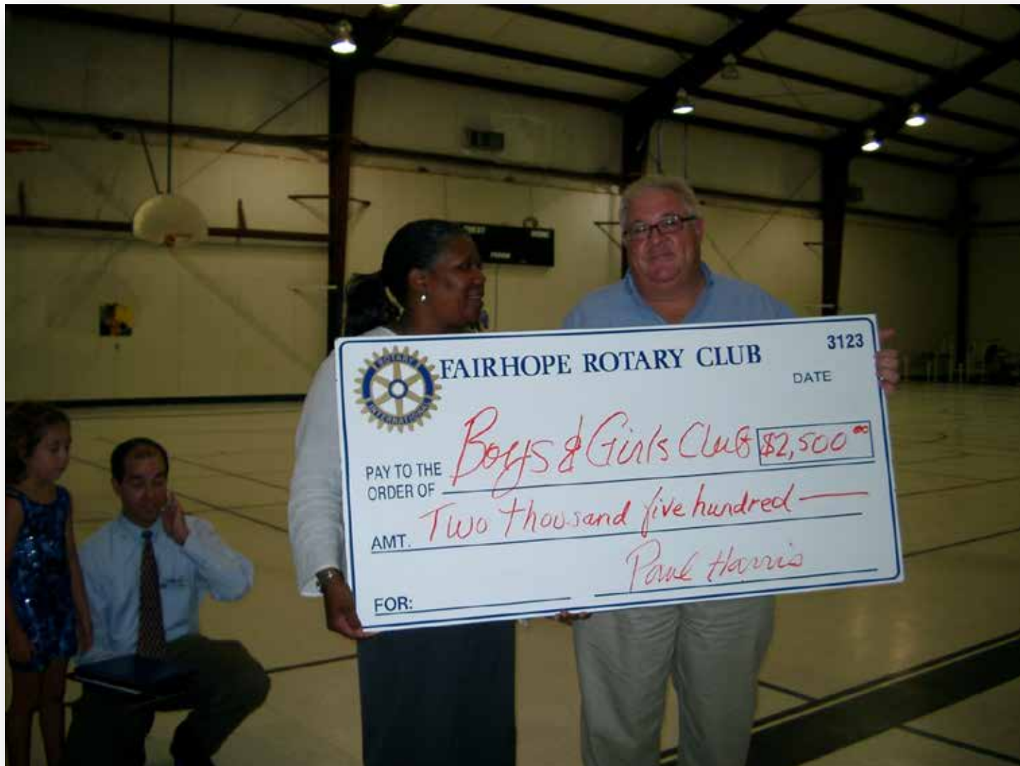
And a 2007 check