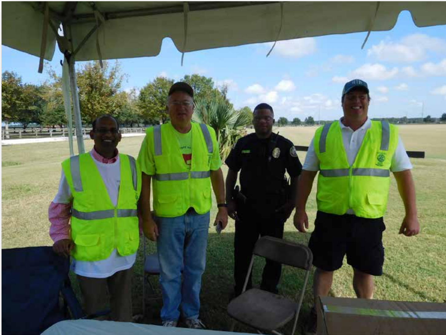
Part of our 2016 Polo at the Point team