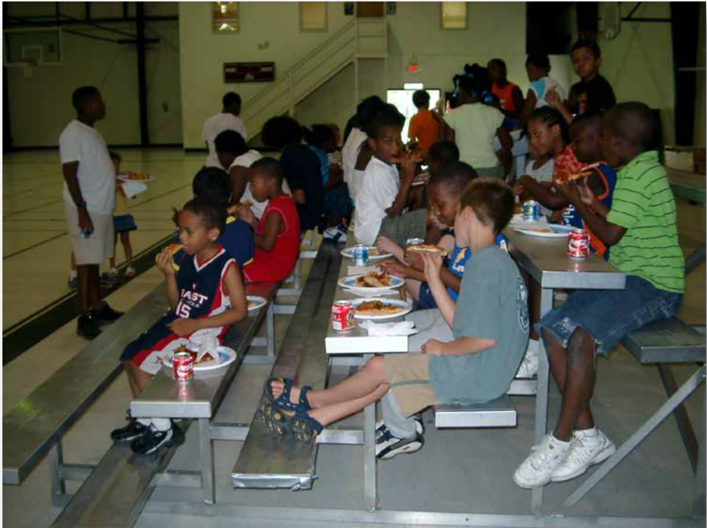
Kids enjoy pizza.