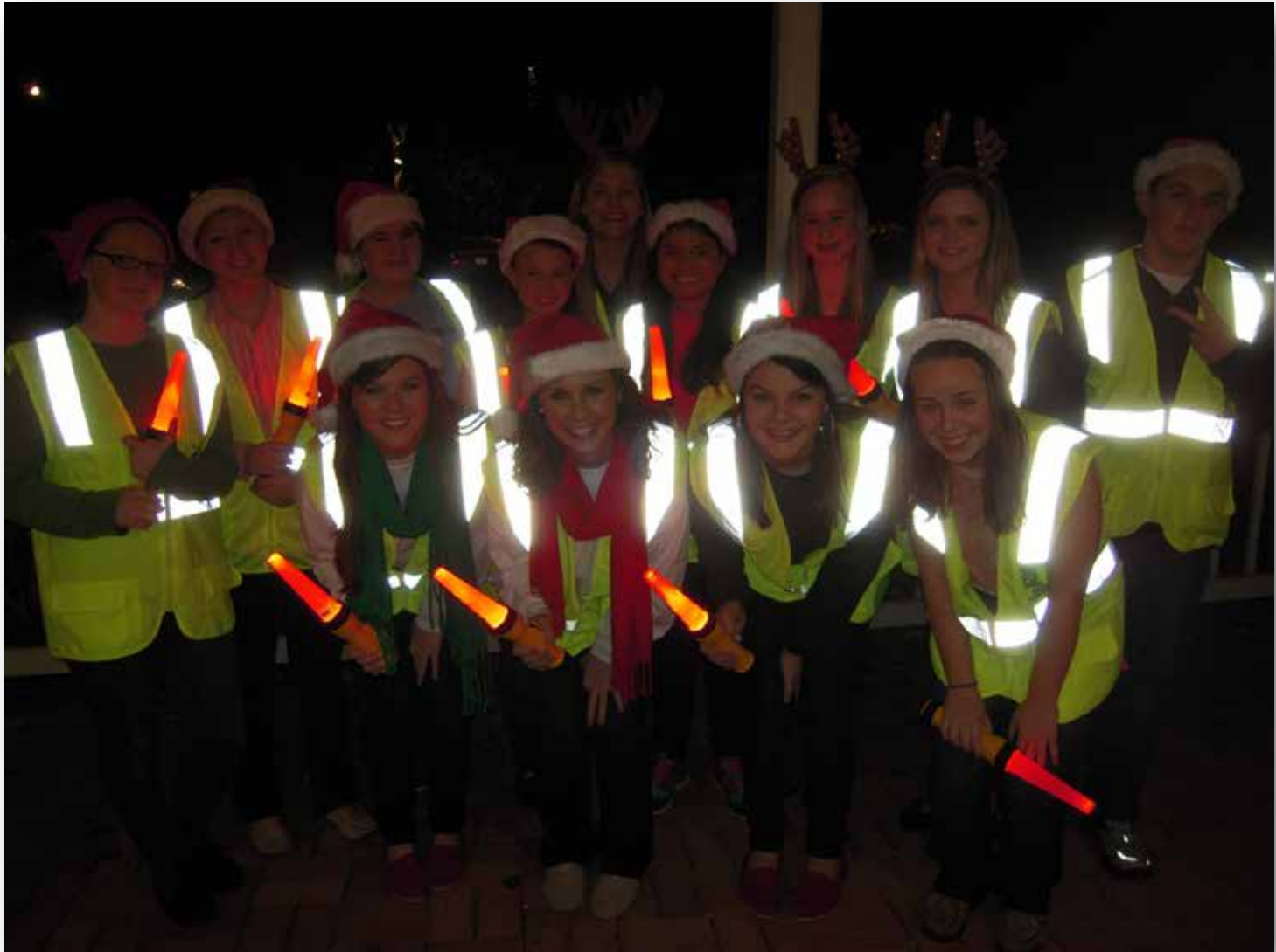
The 2012 group of float marshals