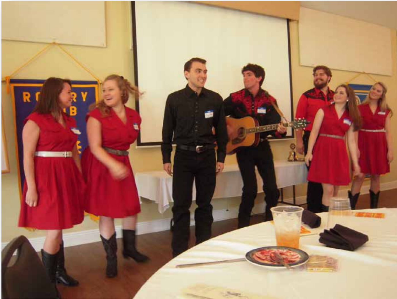
The 2015 appearance of cast members from the University of Alabama Department of Theatre & Dance's SummerTide program