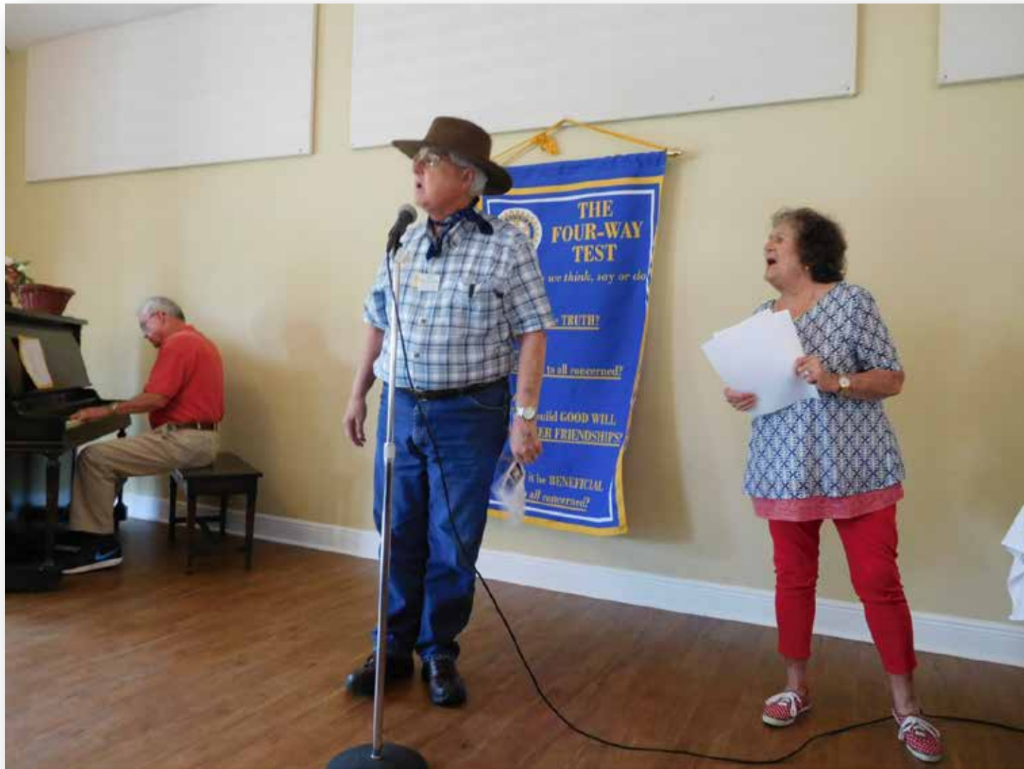
Another Blacklaw-Jones musical production