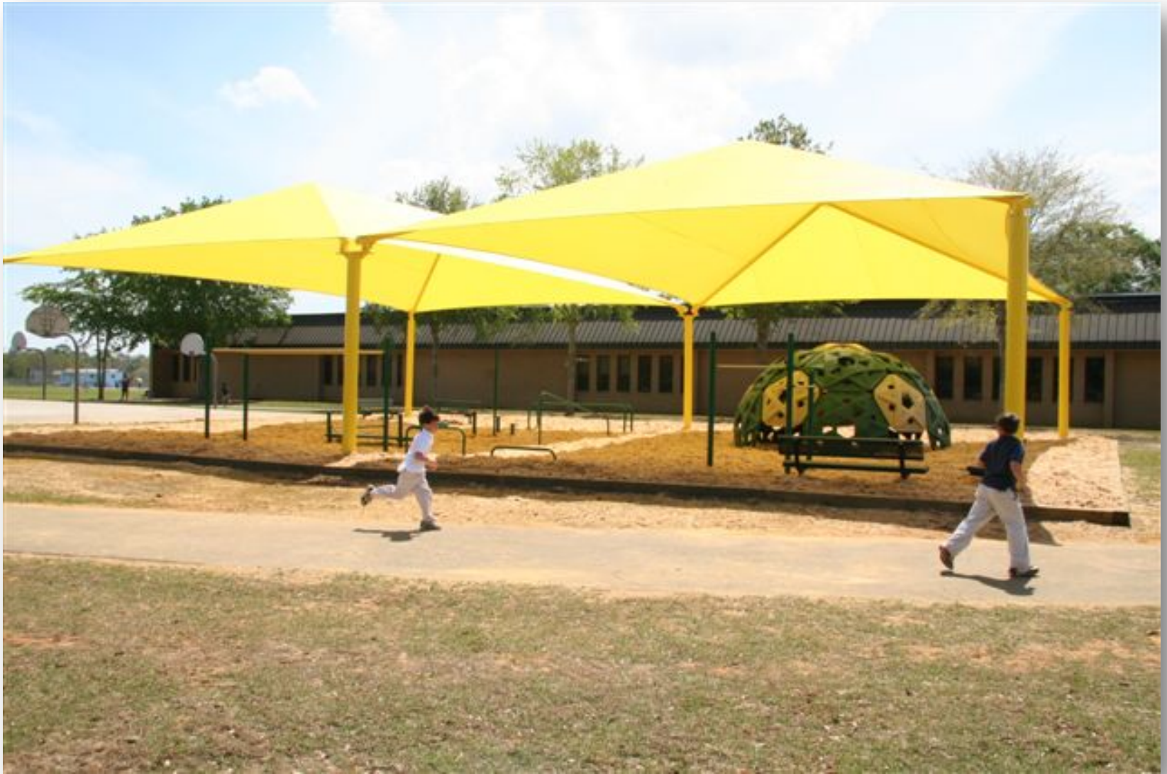
This is the cover at Fairhope Elementary School.