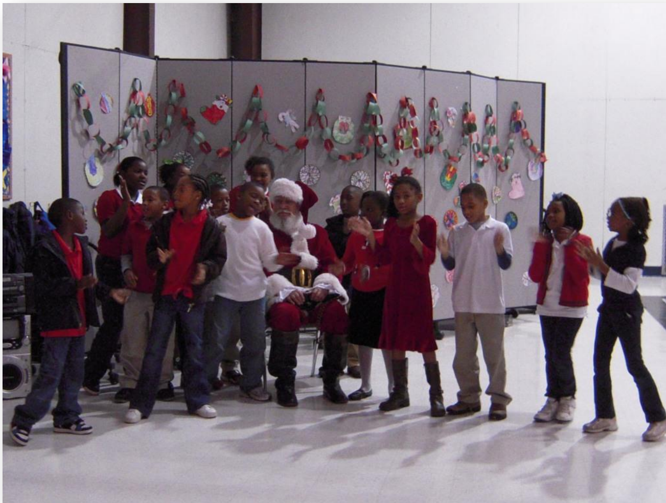
Christmas party in 2009