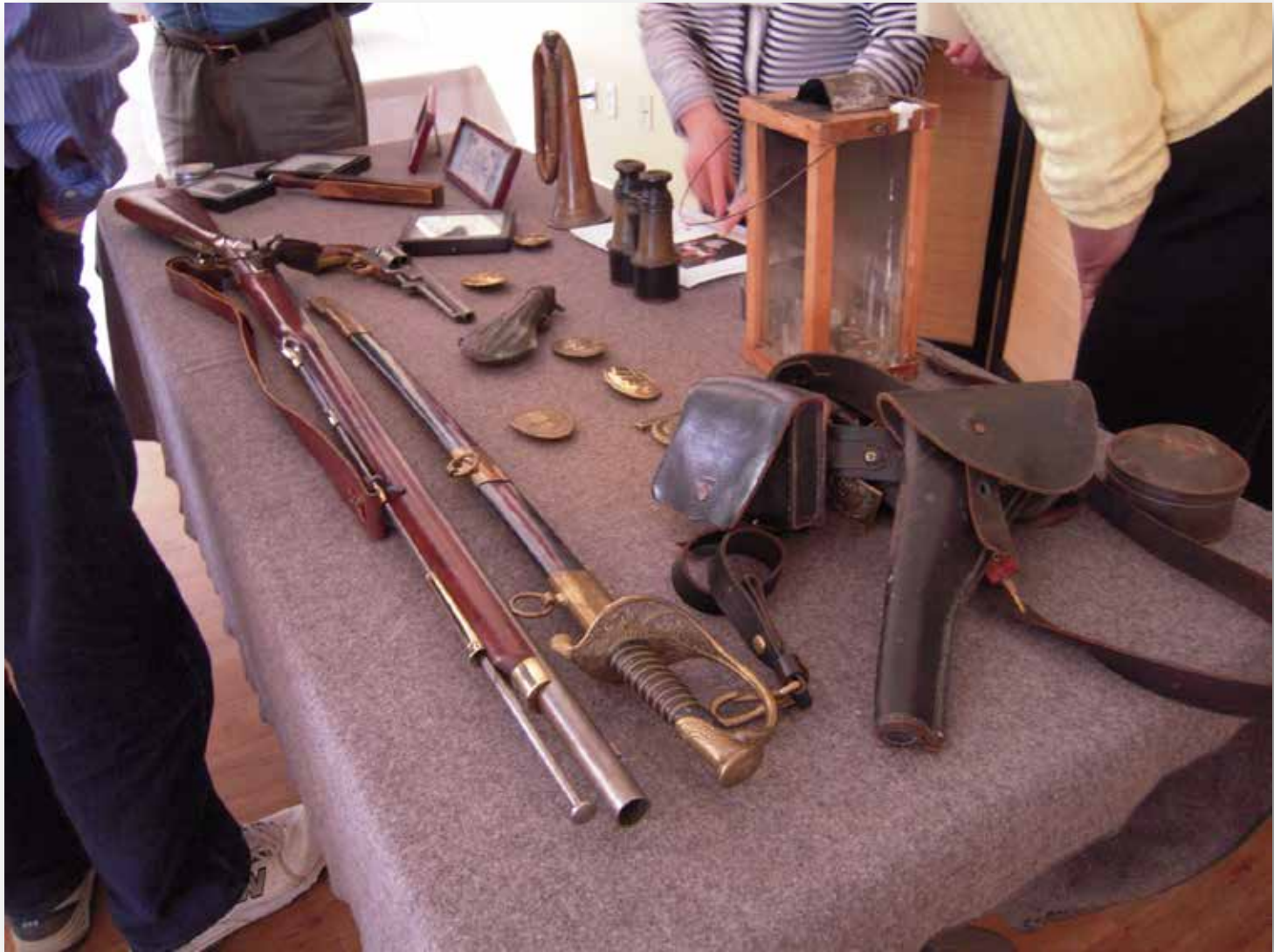
Civil War gear