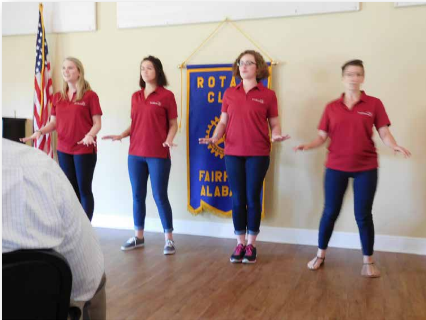
Another SummerTide Theatre cast presentation in 2016