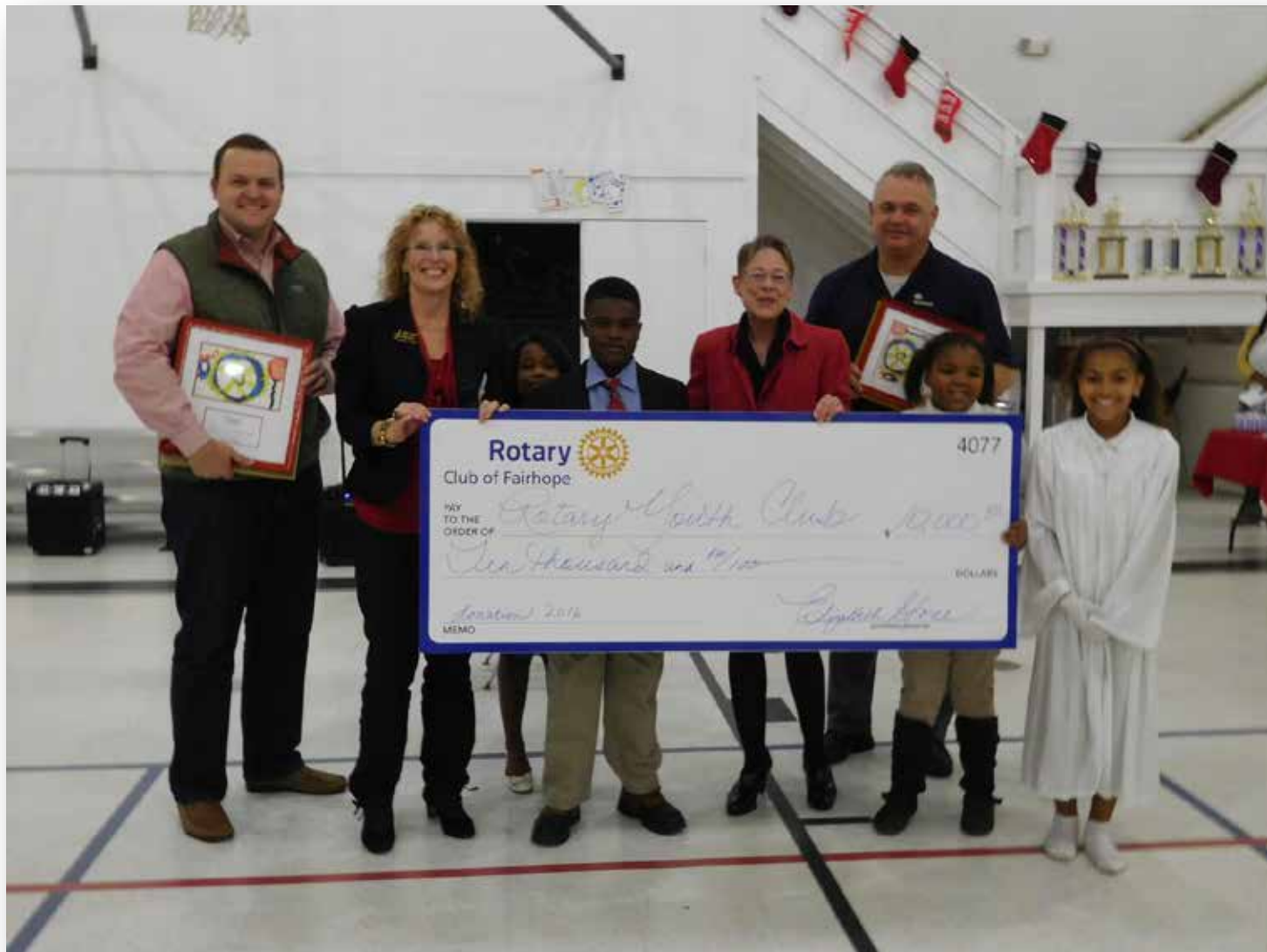
Our Christmas 2017 check (there was one in 2016, too)