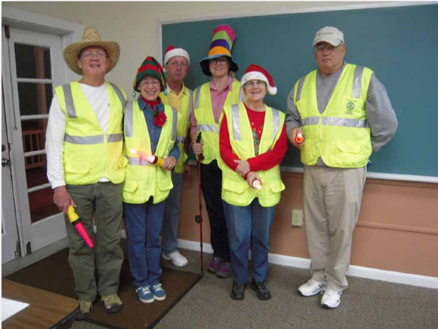
2014 float marshals