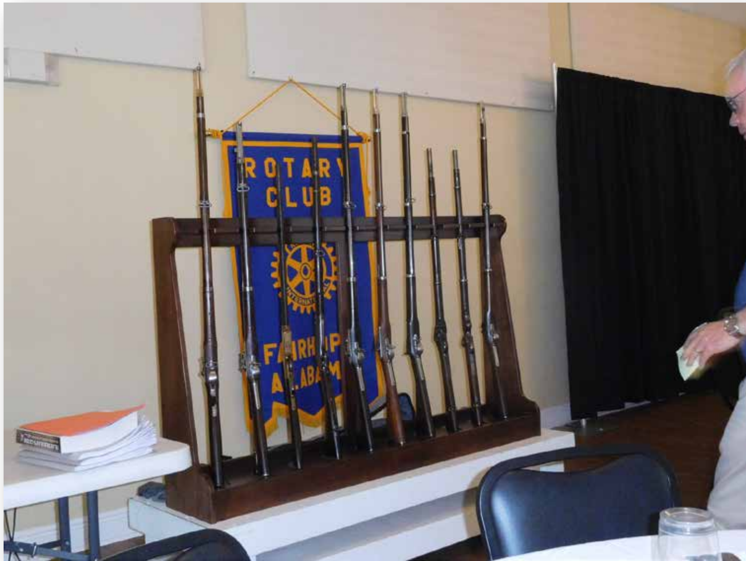
A presentation on historic guns