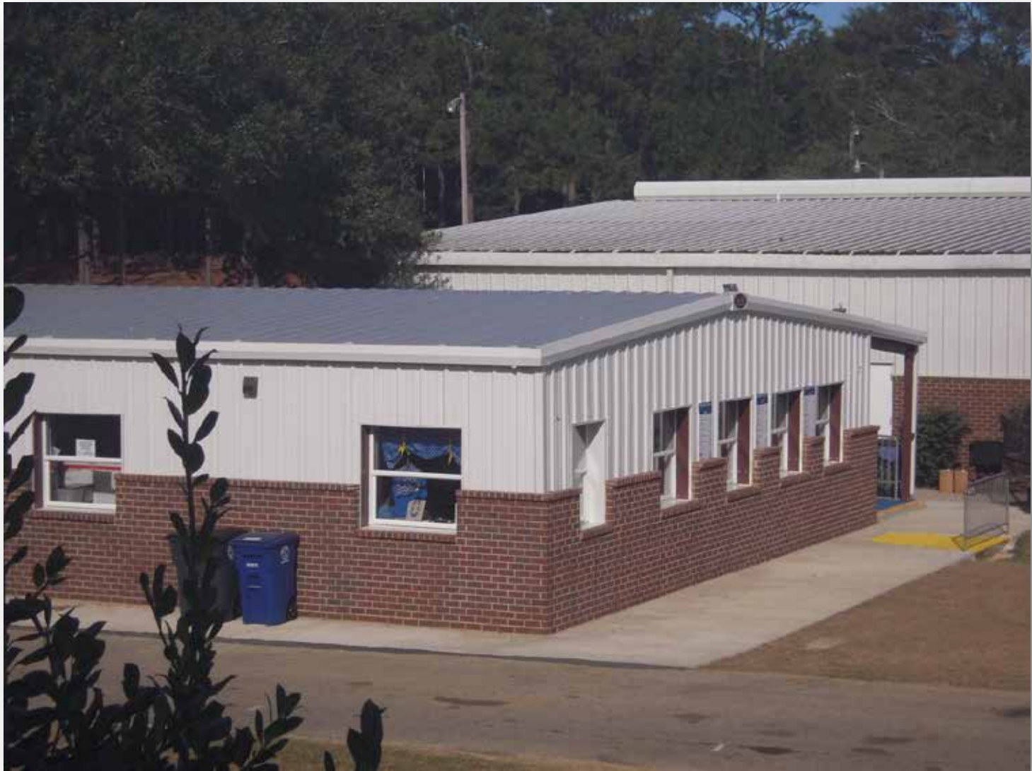
"Pirate Galley" concession stand at Majors Field