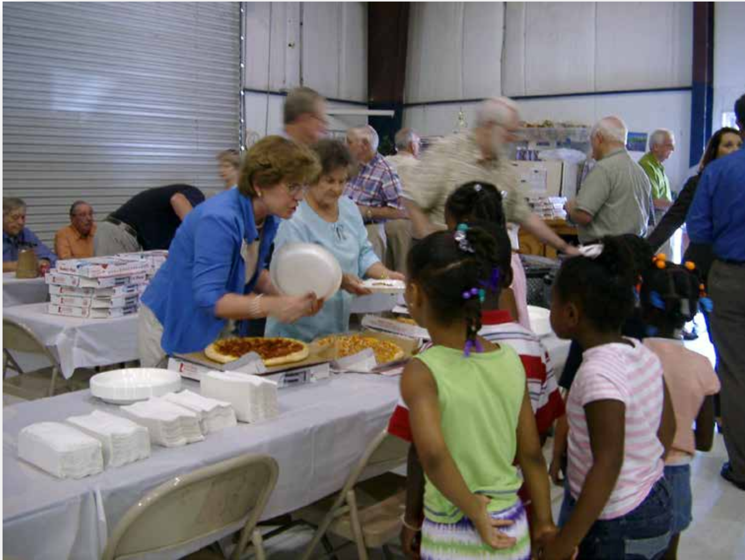
Another pizza party in 2007